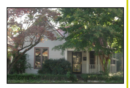
319 South 11th Street

skip all or parts of the design phase, which can catch potential problems and solve them before the project is under construction where every change is costly. More importantly, accurate drawings assure that what you expect in your new home or addition is properly communicated to the contractor and can help to avoid potential violations of the building permit. "Invest in the design," warns Hodge. "To paraphrase, an ounce of design is worth a pound of construction." Whatever your design and whatever your chosen approach, the addition or building will have large impact on the overall look of the district and so should be considered very carefully. As Zeitlin says, ultimately any design "should not only reflect the unique requirements of the homeowners but also should add to the quality of