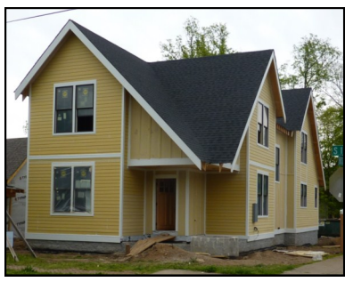
321 South 11th Street