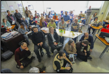
A packed house at one of the Old House Fair presentations.