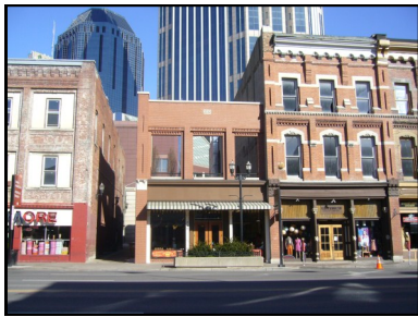
Below: The new building completed.