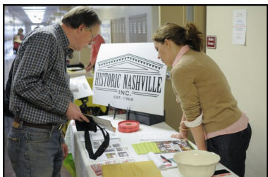
Historic Nashville tells an attendee about the benefit of membership.

The second annual Old House Fair was a great success with almost 400 people in attendance.