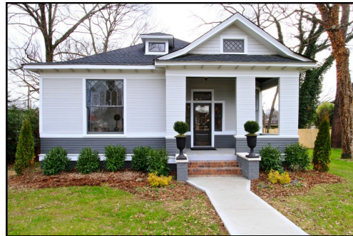
753 Benton received an award in 2012 for its remarkable transformation. The residence required significant repairs for deterioration concealed for decades under faux brick asphalt siding. The original siding was severely damaged and years of neglect and termites had taken their toll on windows and framing.

This year marks the 38th Anniversary of the Metropolitan Historical Commission's annual awards program. Winners will be announced at a public ceremony in May 2013, date and time to be determined.