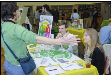
An attendee explains her project to one of the exhibitors.