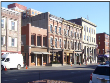
Below: 406 Broadway