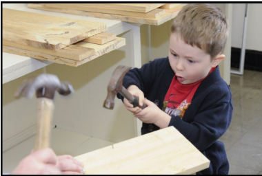
Children of all ages enjoyed putting together their own bat houses.