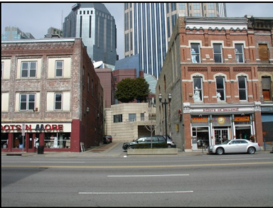
Above: Broadway prior to construction.