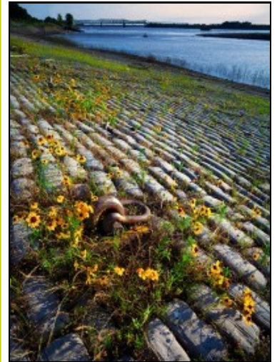
Cotton Exchange, Steamboat Wharf, Memphis

Ten in Tennessee has advocated for 90 sites already and continues to encourage local, state, and federal leaders to invest in the past for our future. The Tennessee Preservation Trust is calling on you to spread the word and/or submit applications for Tennessee's endangered sites.