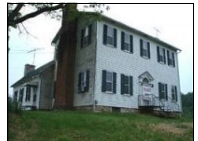
Taylor Home at Sabine Hill, Carter County.