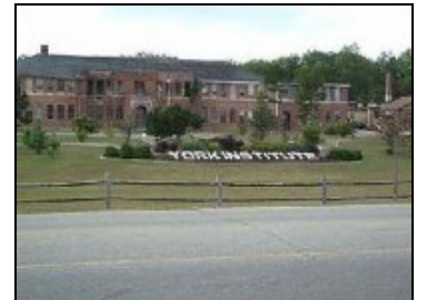
Alvin C. York Agricultural Institute was listed in 2005 and received a Tennessee Historical Commission grant for continue rehabilitation.