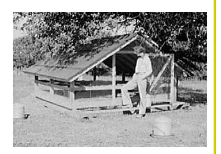
Library of Congress, 1941

Metro Council recently adopted an ordinance that allows for a small number of hens to be kept in urban areas. Chicken houses in our historic areas are not a new idea as many people in our oldest neighborhoods likely enjoyed fresh eggs, but the construction of a chicken house or a fence didn't need a Preservation Permit back in the day. Will you? The short