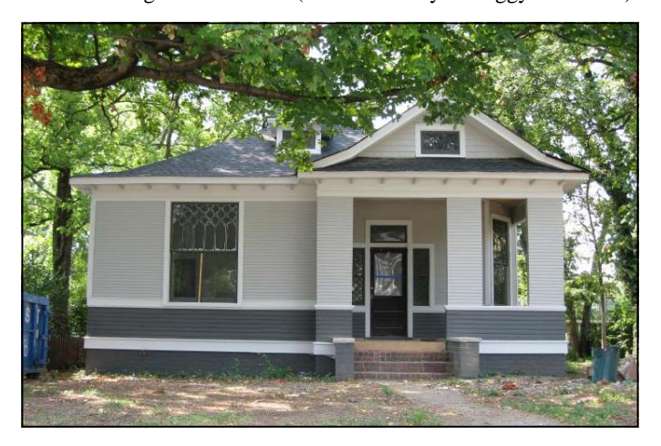
2011 after rehabilitation