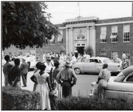
Segregationists exchange words with supporters of desegregation on September 9, 1957. Image courtesy of and another of the six the Nashville Public Library. Cotton Elementary and another of the six the Nashville Public Library.