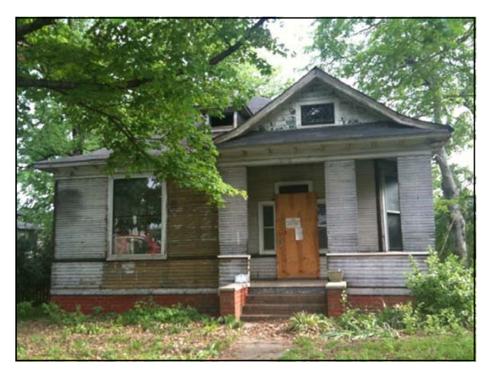
2011 during rehabilitation