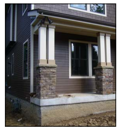
The foundation plans showed a porch depth of 4', the elevations showed a porch depth of 6' and the floor plans showed a depth of 8'. This homeowner now as a portion of their porch too narrow to be useful.

Remember that when the Commission approves a project, they are approving the drawings you submitted to them, not just the concept . Avoid delays and additional expense by planning well and keeping us informed of changes.