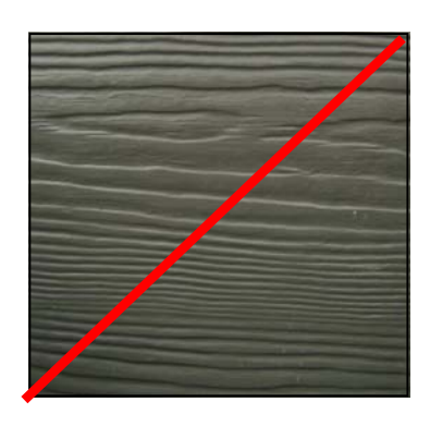
Fiber cement siding is an appropriate cladding for new construction but not when it has a faux (embossed) wood grain, as seen above. Below is an example of a smooth fiber cement siding that looks more like historic wood siding.