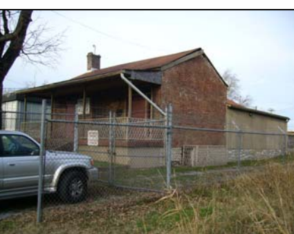
The Warner House, 2011.

Nashville's Civil Rights history. Four African-American children, two girls and two boys, attended class on September 9, 1957, amid white protestors. The African-American custodian was badly beaten by a white mob at the end of the school day and crosses were burned in the yards of neighboring African-Americans that night. On September 10, nearby Hattie Cotton Elementary desegregating schools were damaged in the