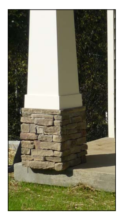
The depth of the stone veneer was not considered, leaving a porch pedestal hanging over the edge of the porch floor.