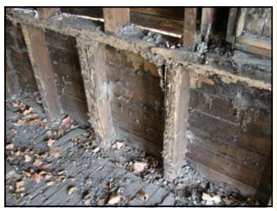
Above: Evidence of termites. Below: Original plat for this area of the neighborhood.