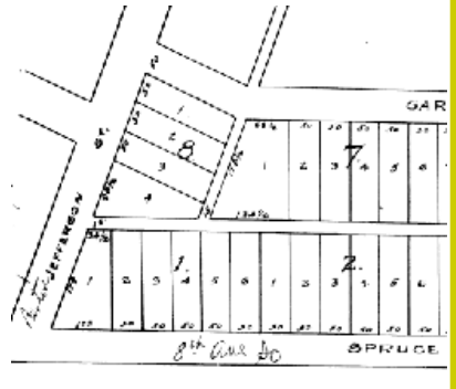
Sybbivision of Blocks 1-2-3 IN YAR BROUGHS SUBDIVIS WOODLAND