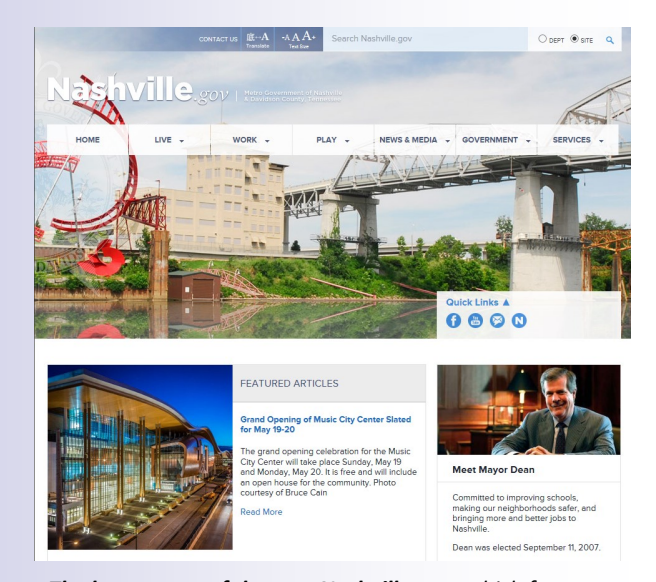
The home page of the new Nashville.gov , which features fully responsive design, thus making it function great on any size device from phones to tablets to PCs.

The site was redesigned to make every interaction on Nashville.gov faster, more convenient and easy to navigate. To be fully mobile friendly, it has been designed to automatically reformat to fit any device screen size from desktop to smartphone.