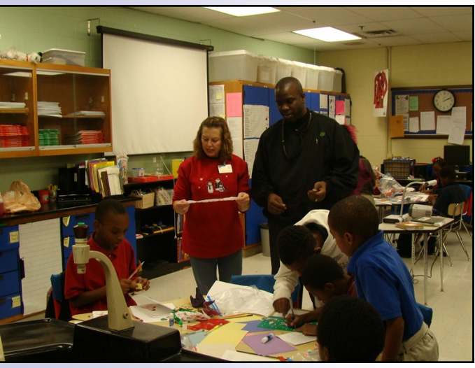
During the 2011 Holiday season, ITS employees worked in conjunction with the Pencil Foundation, helping kids at Glenn Elementary School make Christmas Cards for their loved ones. In addition, the children were learning how to write and sell books. The money they raised was used to purchase gifts for loved ones.