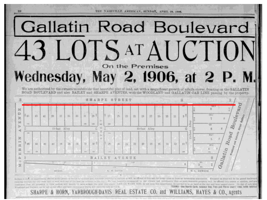
Figure 3: "Gallatin Road Boulevard: 43 Lots at Auction," Nashville American, April 29, 1906.