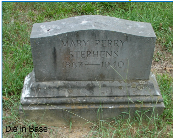
Die in Base

Die-in-Socket: With a Die-in-Socket the tablet has a tab that fits into a socket in the base. The image on the right shows a base missing the tablet allowing a view of the socket. (Images from Nashville City Cemetery.)