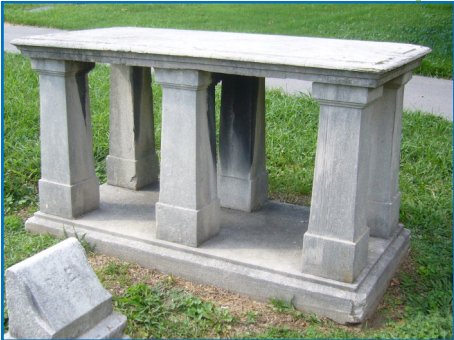
Table tomb: Ledger set on 4 to 6 feet. This monument looks similar to a box tomb but with four to six legs rather than enclosed sides. (Images from Nashville City Cemetery. (Image from Nashville City Cemetery.)

Pulpit Markers: Height is usually less than 30". The monument has an inscription on top or side and will typically have a book (bible) or scroll on top. Often there will be an inscription in the book.