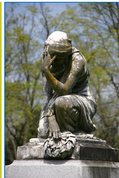
Mt. Olivet Cemetery

DO NOT allow children to climb, sit or lean on monuments since many monuments are unstable and could cause serious injury.